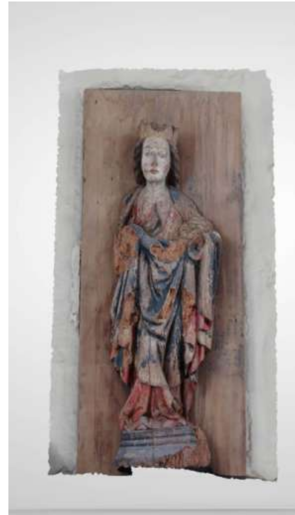
Bas-relief of Virgin Mary, wood, app. 1 m high