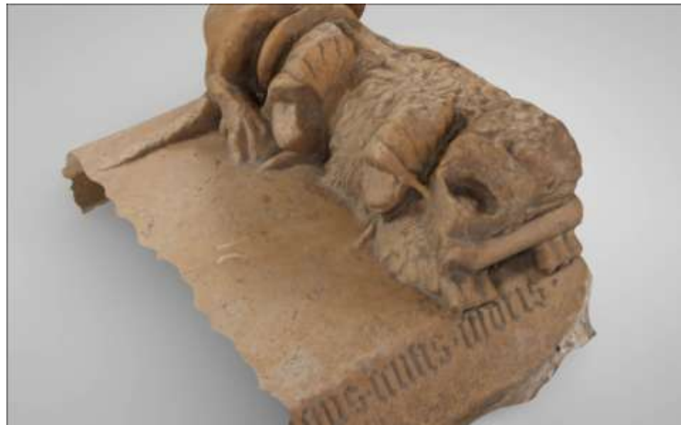
Detail of a lion, marble