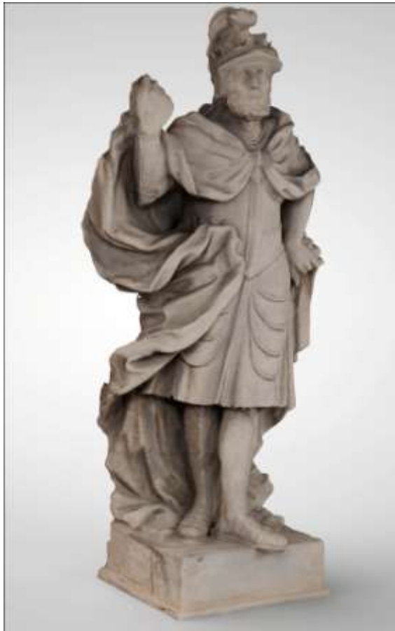
Statue of a King, marble, app. 2 m high