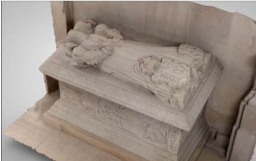
Sarcophagus of Isabela Zapollya, marble