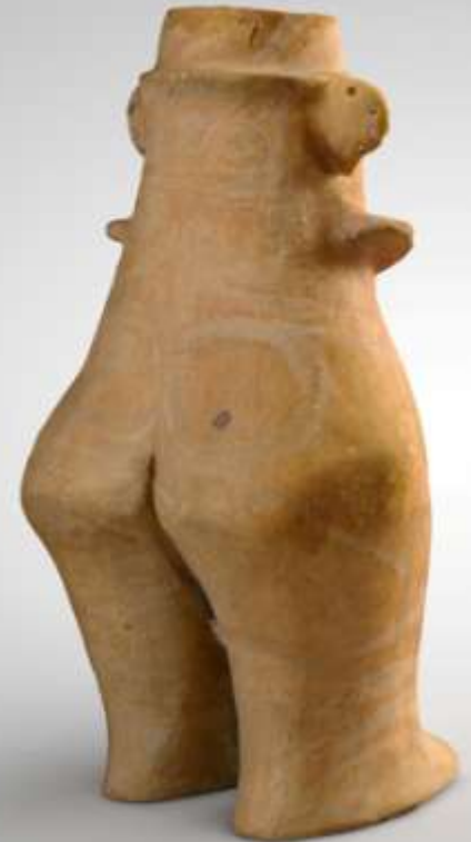
Neolithic idol, clay, Sultana Malu-Roșu archaeological site, Romania